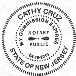
A NOTARY PUBLIC OF NEW JERSEY My Commission Expires April 16, 2019

IN TESTIMONY WHEREOF, I have hereunto set my hand affixed my Official Seal, at the City of Newark, New Jersey the day and year first above written.