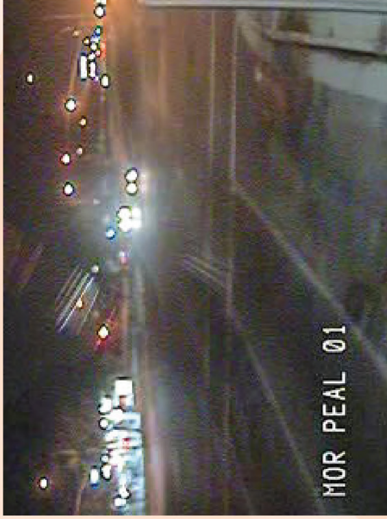
Northbound Perris Boulevard at Alessandro Boulevard