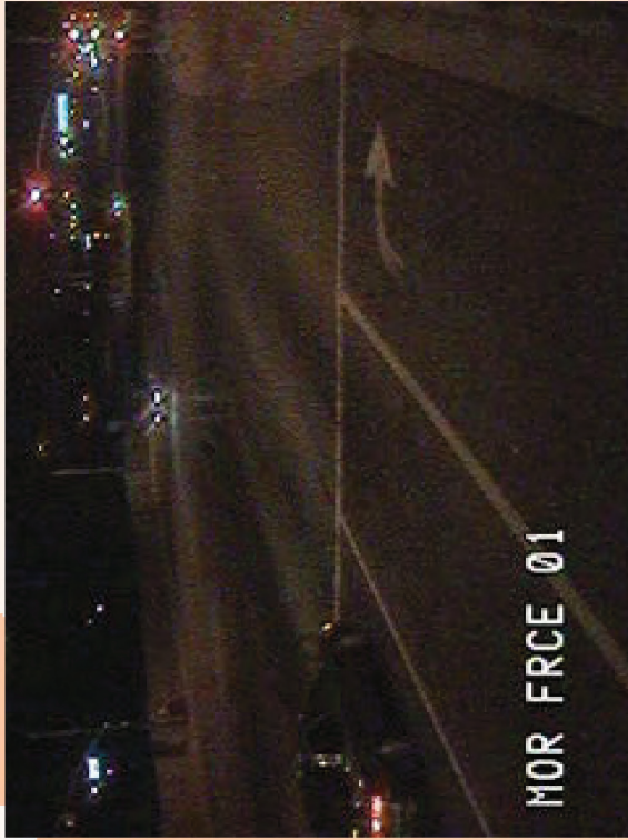
Southbound Frederick Street at Centerpoint Drive